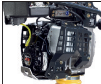
All around engine protection.